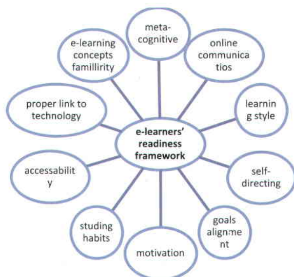
Figure 2. E-learners' readiness framework