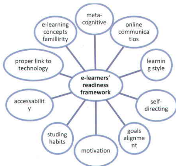
Figure 2. E-learners' readiness framework