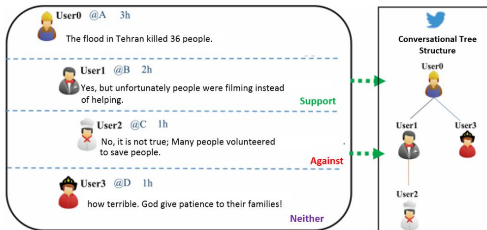
Figure 1. Tree Structure of Social Media Conversational