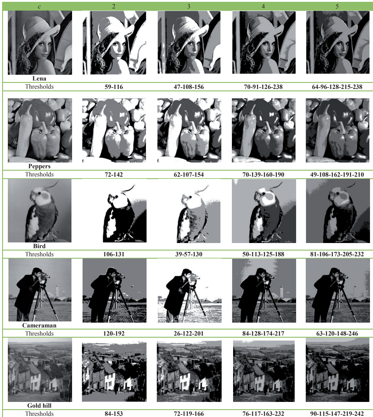
Figure 4. The thresholded images of 'Lena', 'Peppers', 'Bird', 'Cameraman' and 'Gold hill' using proposed method, 2-5 level thresholds.

Table 3, reveals the comparison of the uniformity measures obtained using four methods for the same 'Lena' and 'Pepper' images. It can be seen that the proposed MELFAT could achieve significantly better segmentation results compared with other methods, as demonstrated by quite higher values of uniformity in each case. They could achieve the uniformity value in the range of 0.9824 to 0.9927 while other methods failed to even reach the uniformity value of 0.9843. Also, for the visual interpretation of the segmentation results, the segmented 'Lena', 'Peppers', 'Bird', 'Cameraman' and 'Gold hill' images with c = 2, 3, 4 and 5 and their corresponding thresholds were presented in Fig. 4 respectively. These figures reveal