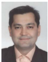
Tehran, Iran. In 1996 he was a lecturer of computer engineering and since 2002, he has been an assistant professor at the Qazvin Branch, Islamic Azad University, Qazvin, Iran. His research interests include image processing, image retrieval, image/video coding, semantic video analysis, data mining and image security.